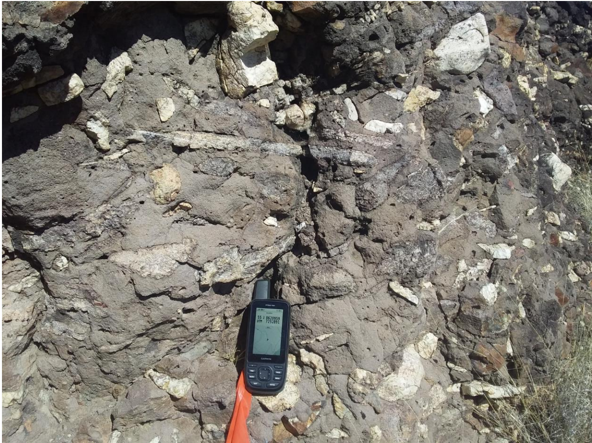
Abundant Lithic Clasts Incorporated in the Base of the Younger Pyroclastic Flow at Buckland Approximately 45km from the Volcanic Centre